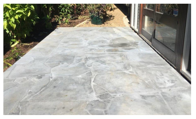
Patio before grout haze cleaning and sealing