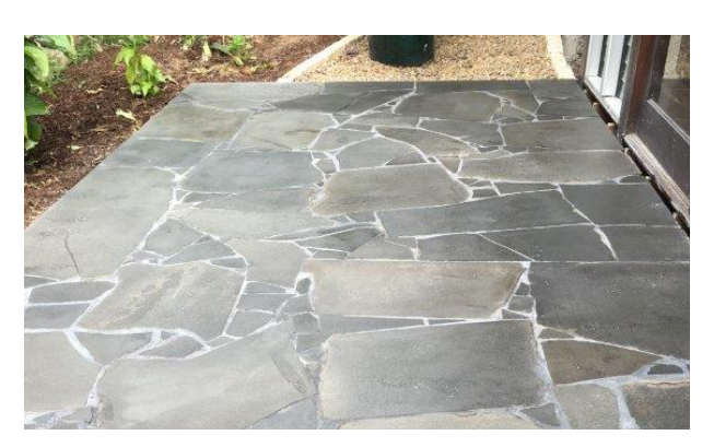
Patio cleaned with Eff-Erayza and sealed with INTENSIFIA